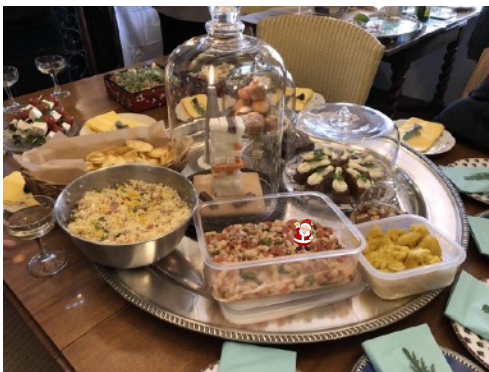
I had a delicious Christmas lunch!