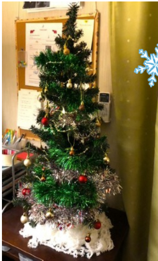
I decorated a Christmas tree!