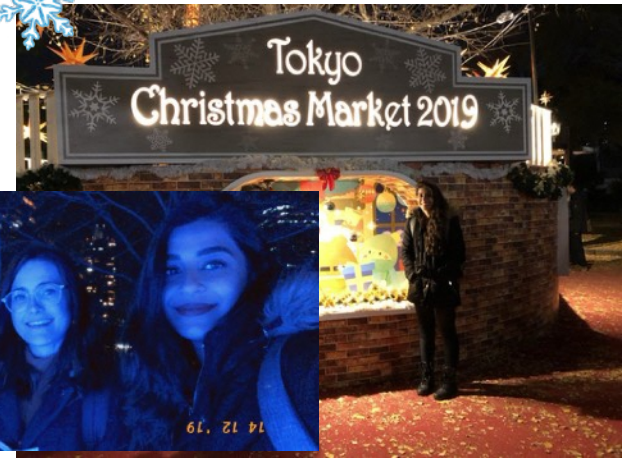
I went to a beautiful Christmas market. They had lots of food and drinks.